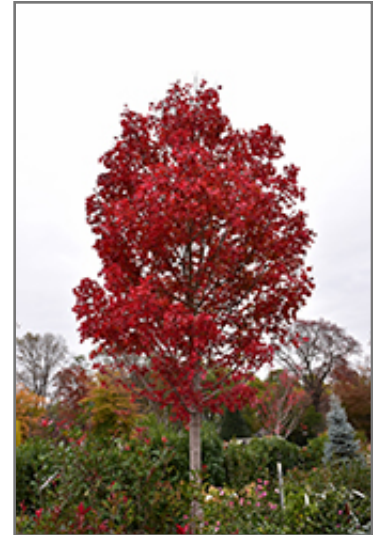
October Glory Red Maple in fall