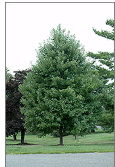
October Glory Red Maple