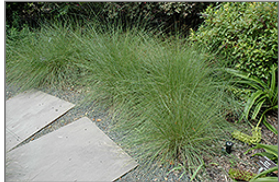
Hairawn Muhly

Hairawn Muhly is recommended for the following landscape applications;