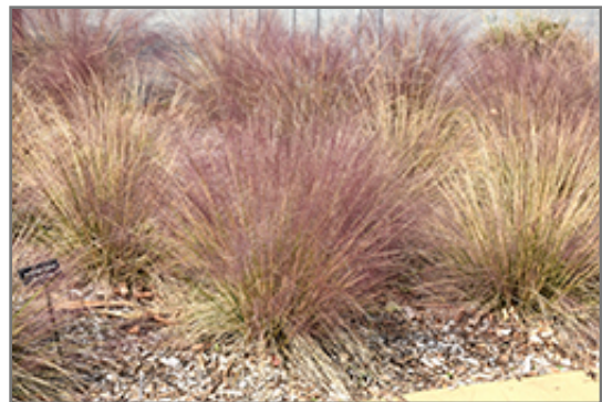
Hairawn Muhly in fall