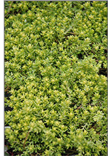
Golden Moss Stonecrop foliage