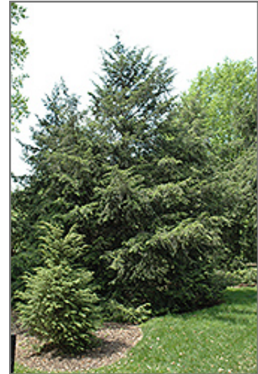
Canadian Hemlock