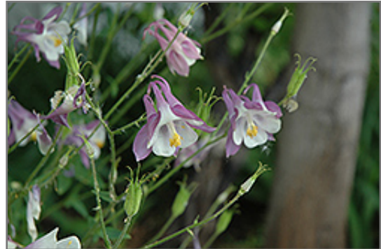
Common Columbine flowers