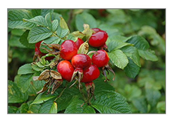
Rugosa Rose fruit