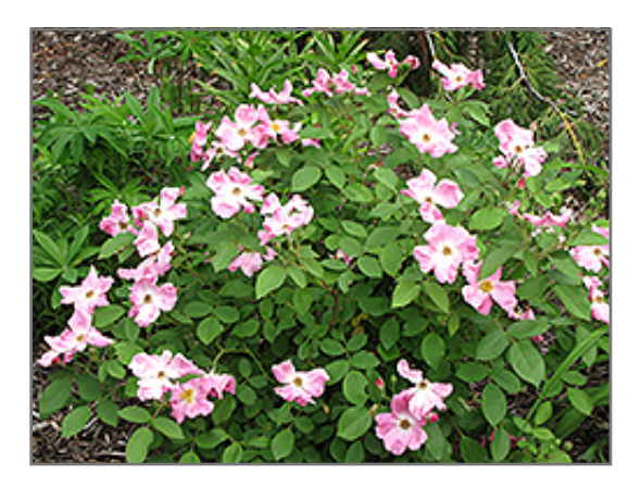
Rugosa Rose in bloom