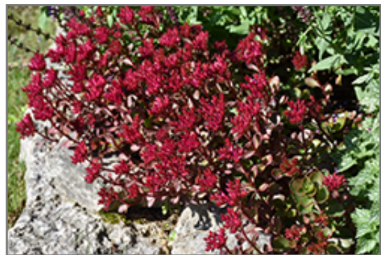
Voodoo Stonecrop in bloom