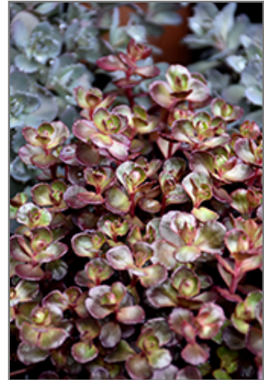
Voodoo Stonecrop foliage

Voodoo Stonecrop is recommended for the following landscape applications;