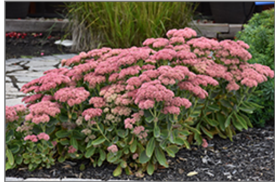
Autumn Fire Stonecrop in bloom

Autumn Fire Stonecrop is recommended for the following landscape applications;