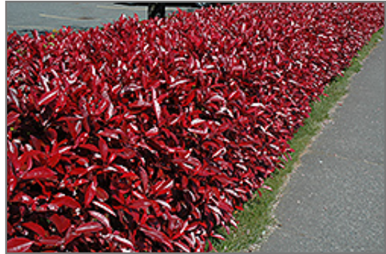
Fraser Photinia

This shrub performs well in both full sun and full shade. However, you may want to keep it away from hot, dry locations that receive direct afternoon sun or which get reflected sunlight, such as against the south side of a white wall. It is very adaptable to both dry and moist growing conditions, but will not tolerate any standing water. It is not particular as to soil type or pH. It is highly tolerant of urban pollution and will even thrive in inner city environments. This particular variety is an interspecific hybrid.