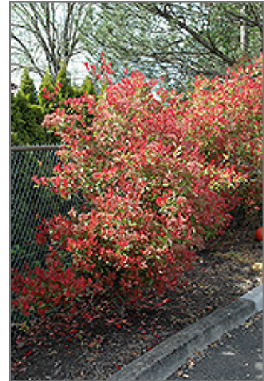
Fraser Photinia in bloom

Fraser Photinia is recommended for the following landscape applications;