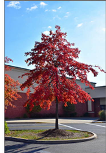
Pin Oak in fall