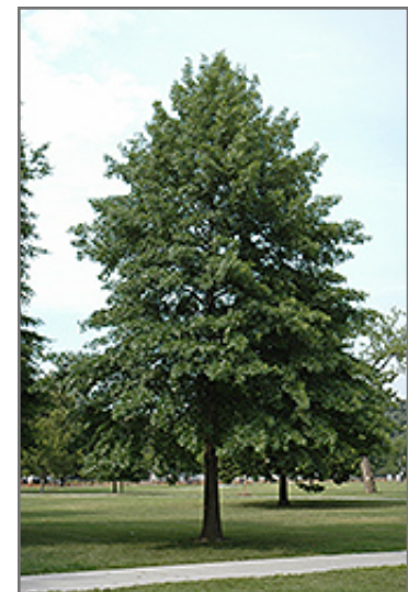
Pin Oak