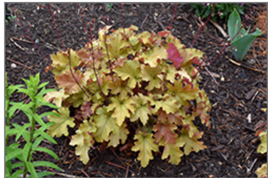
Marmalade Coral Bells