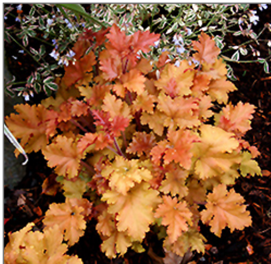
Marmalade Coral Bells foliage

Marmalade Coral Bells will grow to be about 8 inches tall at maturity extending to 18 inches tall with the flowers, with a spread of 16 inches. When grown in masses or used as a bedding plant, individual plants should be spaced approximately 14 inches apart. Its foliage tends to remain low and dense right to the ground. It grows at a medium rate, and under ideal conditions can be expected to live for approximately 10 years. As an evergreen perennial, this plant will typically keep its form and foliage year-round.