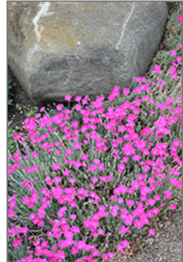
Firewitch Pinks in bloom

Firewitch Pinks is a fine choice for the garden, but it is also a good selection for planting in outdoor pots and containers. It is often used as a 'filler' in the 'spiller-thriller-filler' container combination, providing a mass of flowers and foliage against which the thriller plants stand out. Note that when growing plants in outdoor containers and baskets, they may require more frequent waterings than they would in the yard or garden.