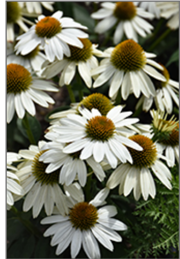
Sombrero Poco White Coneflower flowers

Sombrero Poco White Coneflower is recommended for the following landscape applications;