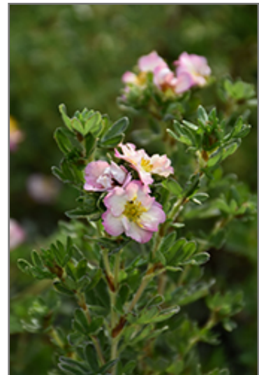
Happy Face Hearts Potentilla flowers