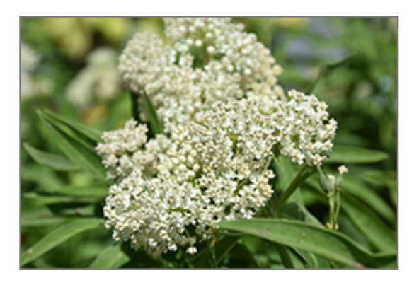
Ice Ballet Milkweed flowers

Ice Ballet Milkweed is recommended for the following landscape applications;