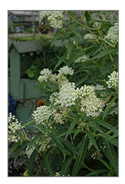
Ice Ballet Milkweed flowers

940 Montauk Highway Bayport, New York web: bayportflower.com phone: 1-800-729-0822