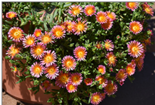
Ocean Sunset Orange Glow Ice Plant flowers