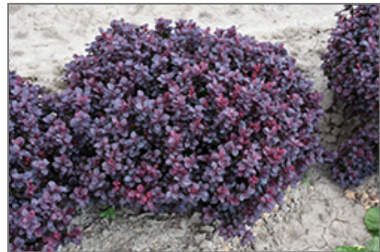
Concorde Japanese Barberry