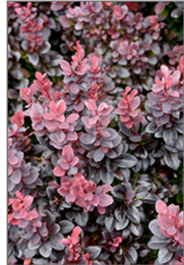
Concorde Japanese Barberry foliage

Concorde Japanese Barberry is recommended for the following landscape applications;