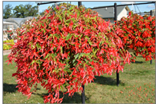
Bossa Nova Rose Begonia flowers