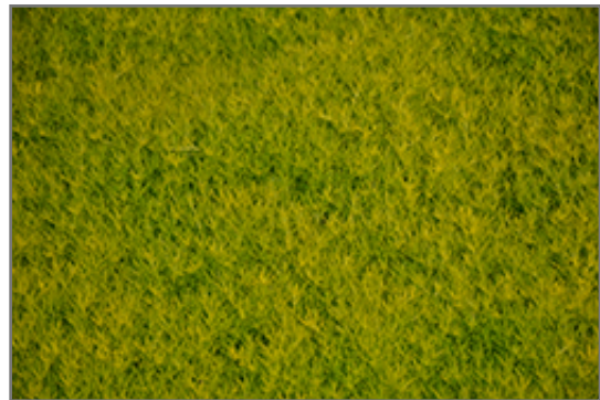
Scotch Moss foliage