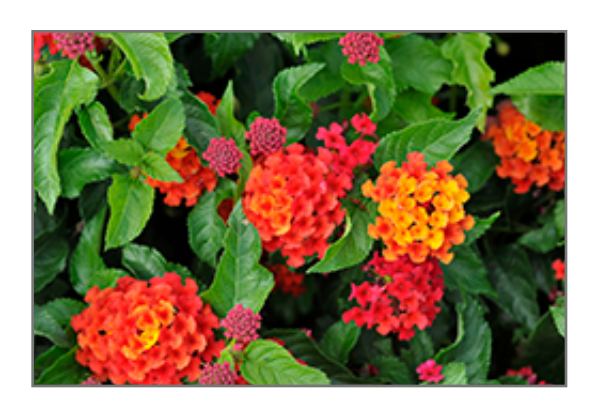
Luscious Royale Red Zone Lantana flowers