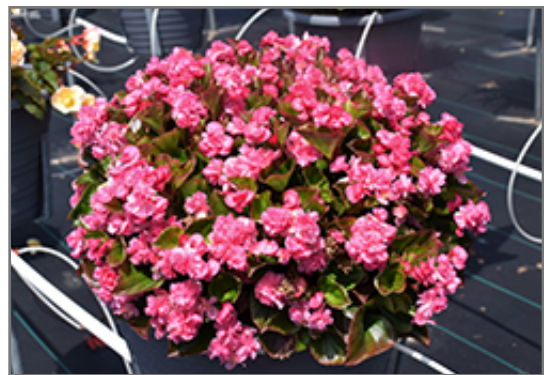
Double Up Pink Begonia in bloom