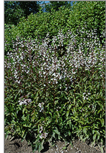
Husker Red Beard Tongue in bloom

Husker Red Beard Tongue is a fine choice for the garden, but it is also a good selection for planting in outdoor pots and containers. With its upright habit of growth, it is best suited for use as a 'thriller' in the 'spiller-thriller-filler' container combination; plant it near the center of the pot, surrounded by smaller plants and those that spill over the edges. Note that when growing plants in outdoor containers and baskets, they may require more frequent waterings than they would in the yard or garden.