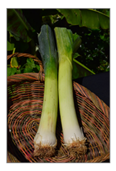
American Flag Leeks fruit

940 Montauk Highway Bayport, New York web: bayportflower.com phone: 1-800-729-0822