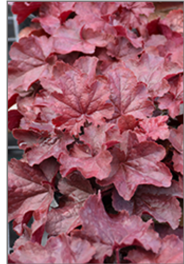
Northern Exposure Red Coral Bells foliage

Northern Exposure Red Coral Bells is recommended for the following landscape applications;