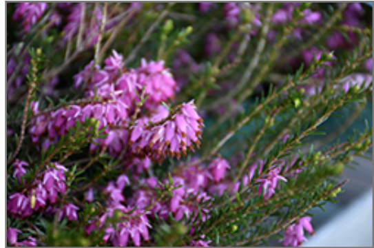
Pink Spangles Heath flowers