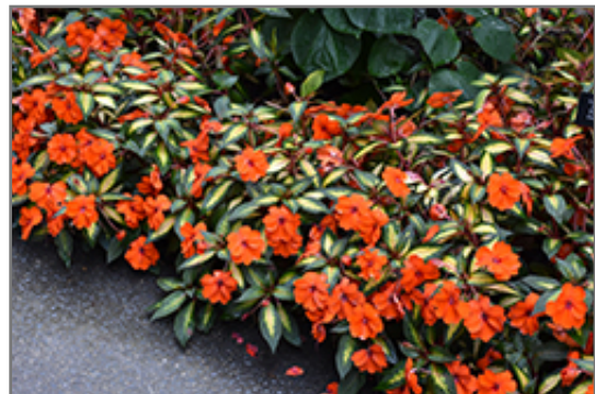
SunPatiens Vigorous Tropical Orange New Guinea Impatiens in bloom