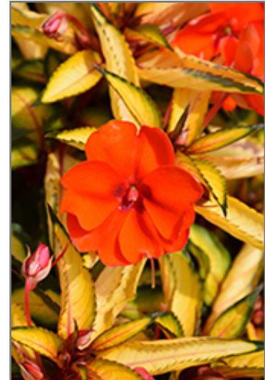
SunPatiens Vigorous Tropical Orange New Guinea Impatiens flowers

This plant will require occasional maintenance and upkeep, and should not require much pruning, except when necessary, such as to remove dieback. It has no significant negative characteristics.