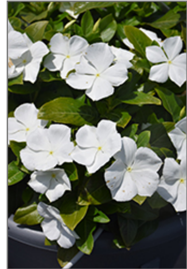
Cora XDR White flowers

Cora XDR White is recommended for the following landscape applications;