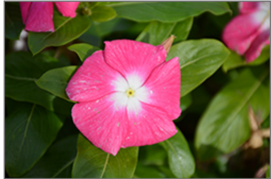
Cora XDR Pink Halo flowers

Cora XDR Pink Halo is recommended for the following landscape applications;