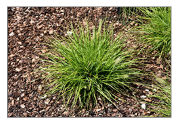
Lumen Gold Fountain Grass

940 Montauk Highway Bayport, New York web: bayportflower.com phone: 1-800-729-0822