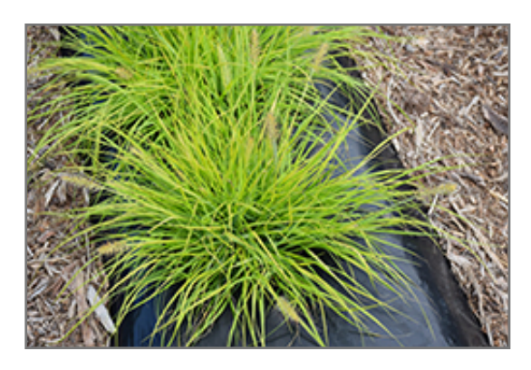
Lumen Gold Fountain Grass