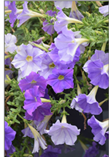
Supertunia Blue Skies Petunia flowers

Supertunia Blue Skies Petunia is recommended for the following landscape applications;