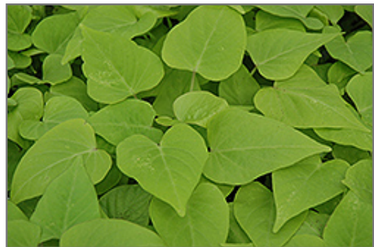
Sweet Caroline Sweetheart Light Green Sweet Potato Vine foliage