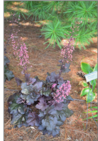
Primo Mahogany Monster Coral Bells in bloom

Primo Mahogany Monster Coral Bells is a fine choice for the garden, but it is also a good selection for planting in outdoor pots and containers. With its upright habit of growth, it is best suited for use as a 'thriller' in the 'spiller-thriller-filler' container combination; plant it near the center of the pot, surrounded by smaller plants and those that spill over the edges. Note that when growing plants in outdoor containers and baskets, they may require more frequent waterings than they would in the yard or garden.