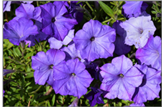
Easy Wave Lavender Sky Blue Petunia flowers

This plant will require occasional maintenance and upkeep. Trim off the flower heads after they fade and die to encourage more blooms late into the season. It is a good choice for attracting bees and hummingbirds to your yard, but is not particularly attractive to deer who tend to leave it alone in favor of tastier treats. It has no significant negative characteristics.