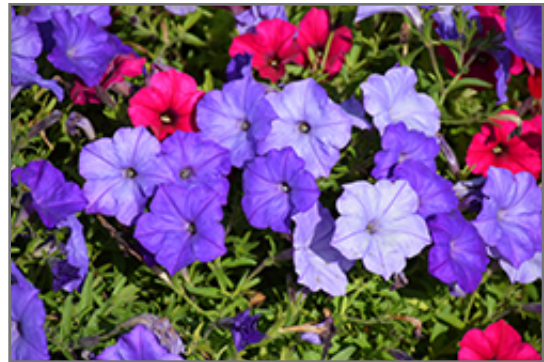
Easy Wave Lavender Sky Blue Petunia flowers