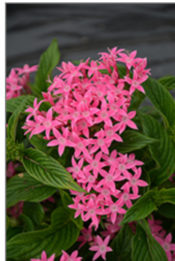
Lucky Star Pink Star Flower flowers

Lucky Star Pink Star Flower is recommended for the following landscape applications;