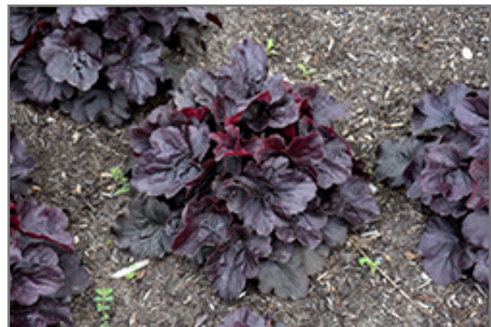
Northern Exposure Black Coral Bells