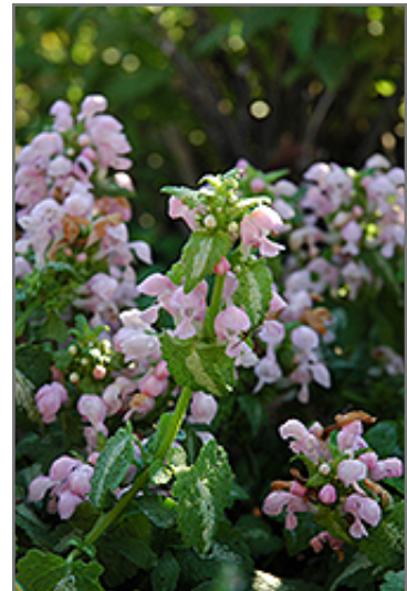
Shell Pink Spotted Dead Nettle flowers