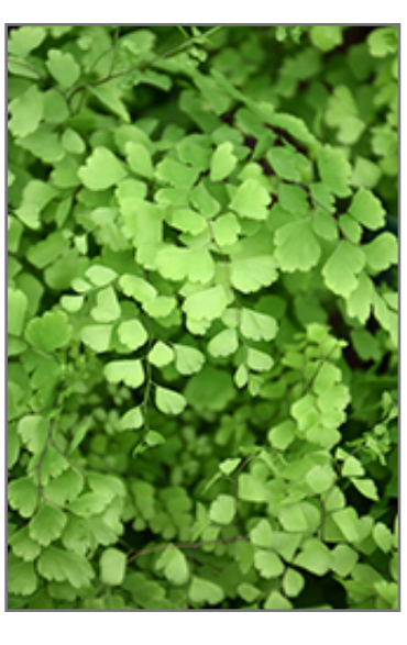
Delta Maidenhair Fern foliage

When grown indoors, Delta Maidenhair Fern can be expected to grow to be about 24 inches tall at maturity, with a spread of 24 inches. It grows at a slow rate, and under ideal conditions can be expected to live for approximately 15 years. This houseplant should be situated in a location that that gets indirect sunlight at most, although it will usually require a more brightly-lit environment than what artificial indoor lighting alone can provide. It prefers to grow in average to moist soil. The surface of the soil shouldn't be allowed to dry out completely, and so you should expect to water this plant once and possibly even twice each week. Be aware that your particular watering schedule may vary depending on its location in the room, the pot size, plant size and other conditions; if in doubt, ask one of our experts in the store for advice. It is particular about its soil conditions, with a strong preference for rich, alkaline soil. Contact the store for specific recommendations on pre-mixed potting soil for this plant. Be warned that parts of this plant are known to be toxic to humans and animals, so special care should be exercised if growing it around children and pets.