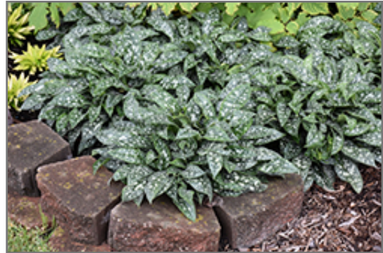
Twinkle Toes Lungwort

Twinkle Toes Lungwort will grow to be about 12 inches tall at maturity, with a spread of 18 inches. When grown in masses or used as a bedding plant, individual plants should be spaced approximately 15 inches apart. Its foliage tends to remain dense right to the ground, not requiring facer plants in front. It grows at a medium rate, and under ideal conditions can be expected to live for approximately 10 years. As an herbaceous perennial, this plant will usually die back to the crown each winter, and will regrow from the base each spring. Be careful not to disturb the crown in late winter when it may not be readily seen!