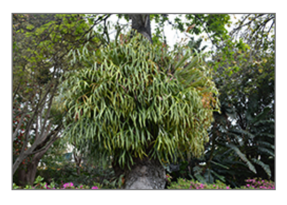
Staghorn Fern