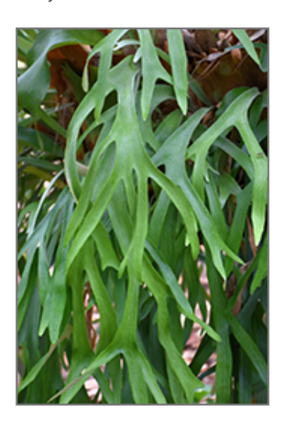
Staghorn Fern foliage