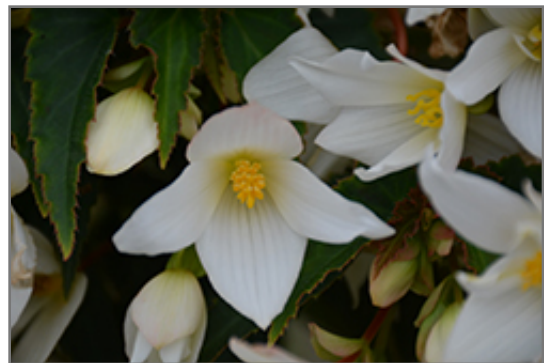
Beauvilia White Begonia flowers