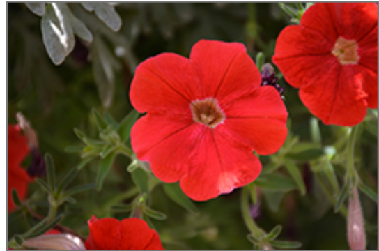
Supertunia Really Red Petunia flowers

This plant will require occasional maintenance and upkeep. Trim off the flower heads after they fade and die to encourage more blooms late into the season. It is a good choice for attracting butterflies and hummingbirds to your yard, but is not particularly attractive to deer who tend to leave it alone in favor of tastier treats. It has no significant negative characteristics.