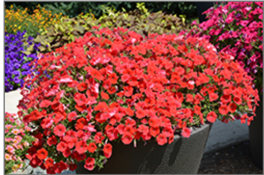
Supertunia Really Red Petunia in bloom

Supertunia Really Red Petunia is a fine choice for the garden, but it is also a good selection for planting in outdoor containers and hanging baskets. Because of its trailing habit of growth, it is ideally suited for use as a 'spiller' in the 'spiller-thriller-filler' container combination; plant it near the edges where it can spill gracefully over the pot. Note that when growing plants in outdoor containers and baskets, they may require more frequent waterings than they would in the yard or garden.