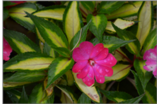
SunPatiens Compact Tropical Rose New Guinea Impatiens flowers