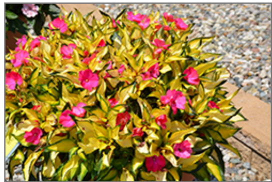
SunPatiens Compact Tropical Rose New Guinea Impatiens in bloom