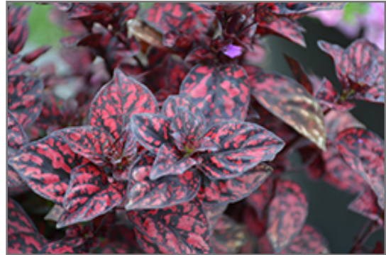
Hippo Red Polka Dot Plant foliage

Hippo Red Polka Dot Plant is recommended for the following landscape applications;