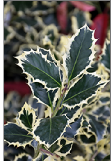
Variegated English Holly foliage