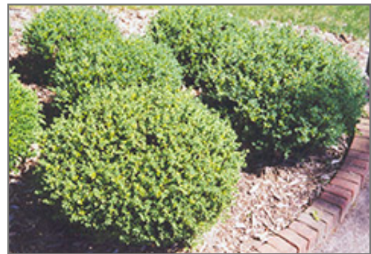
Japanese Boxwood