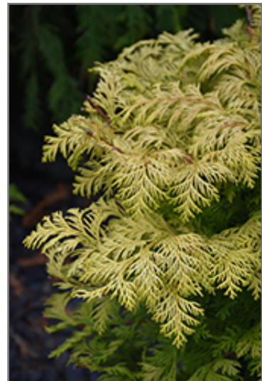
Cripps Gold Falsecypress foliage