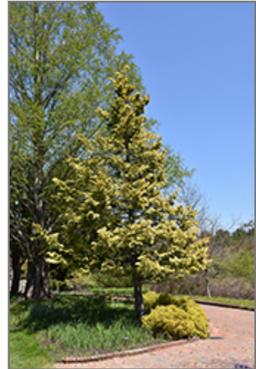
Cripps Gold Falsecypress

This tree does best in full sun to partial shade. It prefers to grow in average to moist conditions, and shouldn't be allowed to dry out. It is not particular as to soil type or pH. It is highly tolerant of urban pollution and will even thrive in inner city environments, and will benefit from being planted in a relatively sheltered location. Consider applying a thick mulch around the root zone in winter to protect it in exposed locations or colder microclimates. This is a selected variety of a species not originally from North America.