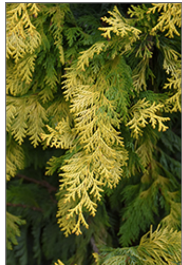
Cripps Gold Falsecypress foliage