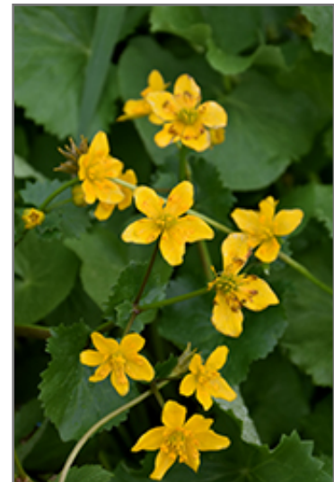
Marsh Marigold flowers