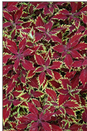
ColorBlaze Royale Apple Brandy Coleus foliage