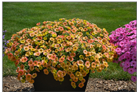
Supertunia Honey Petunia in bloom