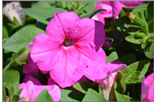
Easy Wave Pink Passion Petunia flowers

Easy Wave Pink Passion Petunia is recommended for the following landscape applications;